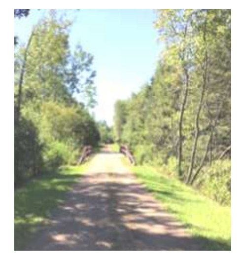
Confederation Trail in Milton.