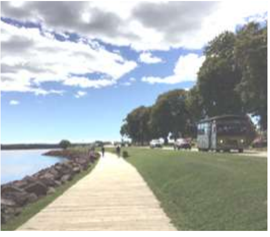
Always something to see at Charlottetown's Victoria Park—on the boardwalk, or in the woods.

You don't need fancy equipment to walk—good shoes and maybe a walking stick or hiking poles will suffice for most. Nor do you need a "facility"—you can walk almost anywhere. But there is no doubt that beautiful surroundings help keep you motivated.