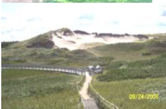
Greenwich—one of the most beautiful places on earth.