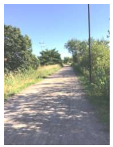
Confederation Trail behind Farmers' Market, Charlottetown. Accessible all year.