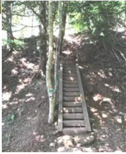
For the somewhat more agile/adventurous—Bonshaw Park (above and left).